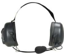
Heavy Duty Behind the Head Headset HS61NR-X83, HS62NR-X83, HS72NR-X83