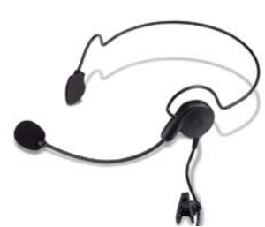
Light Duty Behind the Head Headset HS12-X83