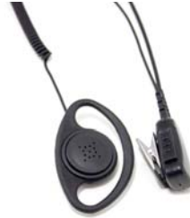
One-Wire Surveillance Kit D-Loop Style SK11DL-X83