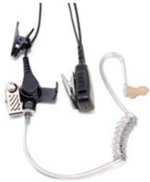
One-Wire Surveillance Kit In-Ear Style SK11NE-X83