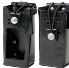
Leather Holsters For RDR3500 & RDR3600