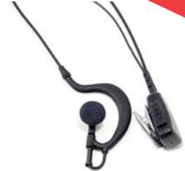
One-Wire Surveillance Kit Ear Hook Style SK11EH-X83