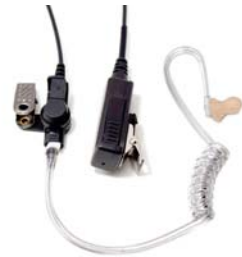
Two-Wire Surveillance Kit In-Ear Style SK21NE-X83