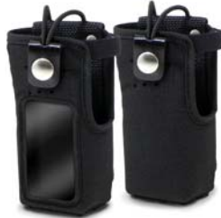
Nylon Holsters For RDR3500 & RDR3600