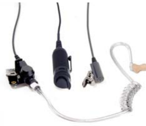
Three-Wire Surveillance Kit In-Ear Style SK31NE-X83